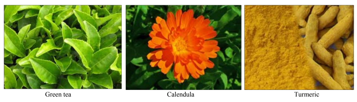
Fig 3: Herbal medicines for skin protection

c) Turmeric: - Turmeric is used in many celebrations of Hindus. Especially in Hindu wedding brides would rub with turmeric on their bodies for glowing look. New born babies also rubbed with turmeric on their forehead for good luck. Traditionally women rub turmeric on their cheeks to produce a natural golden glow.