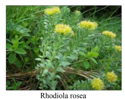
Fig 2: Herbal medicines for anti-aging treatment