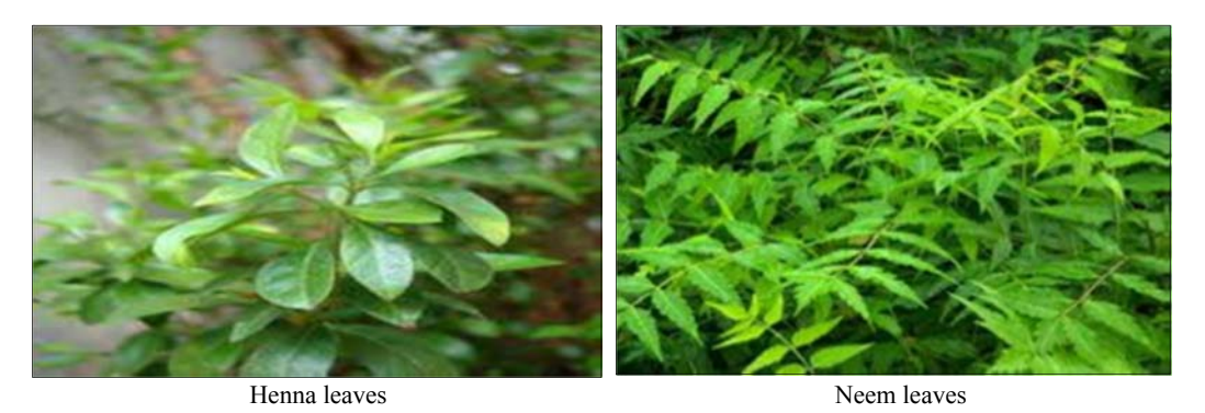
Fig 3: Herbal medicines for dandruff treatment